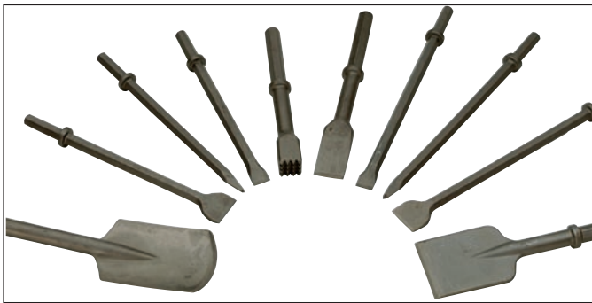
MDT-22 uses standard 7/8" X 3 1/4" shanks.

Directs exhaust air away from the operator and provides a comfortable grip. It also greatly decreases the sound level of the tool.